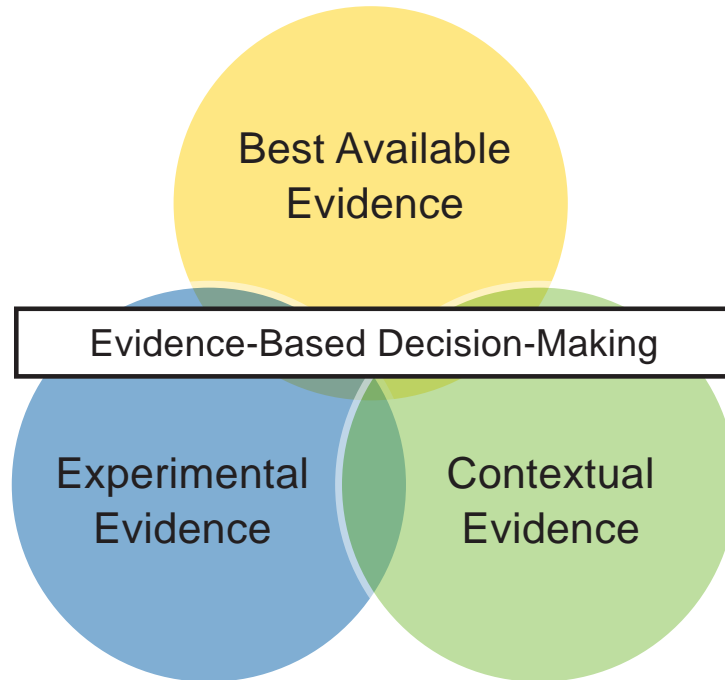
Figure 1. Framework for Thinking About Evidence (CDC, 2011)